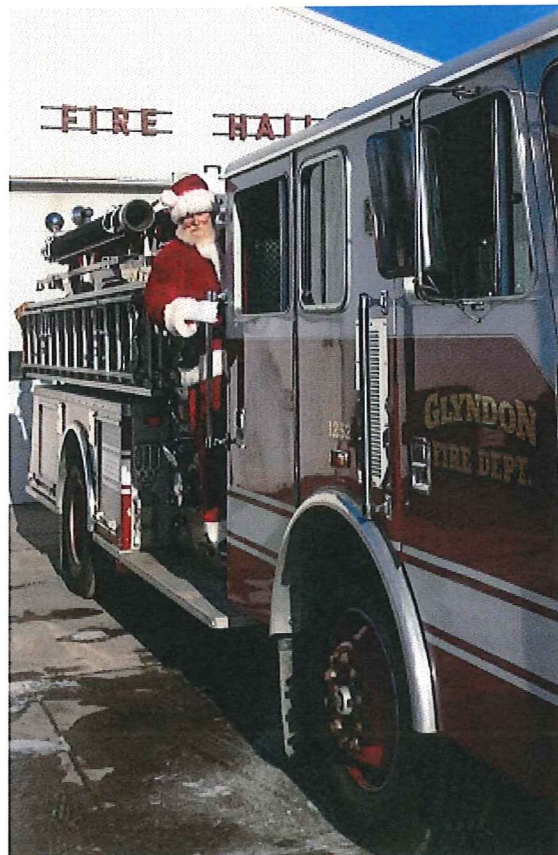
Santa Loves Fire Trucks Too

Santa visited the Fire Hall again this year and rode through town on Engine 2, wishing all a Merry Christmas. Additionally, we again partnered with Dilworth Fire for Hope for the Holidays providing gifts for families in need.