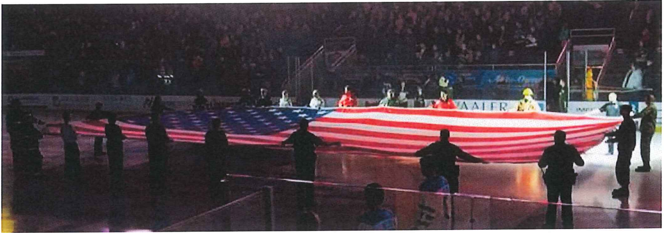
Home Town Heroes