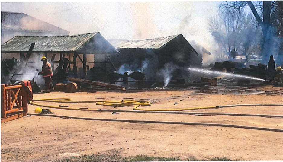
One of our fires